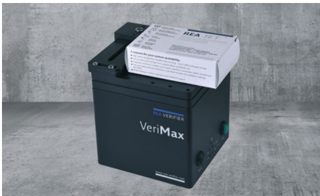
REA VeriMax with test specimen on

With REA VeriMax, you can quickly find out whether you are using the EU and FDA (US) specifications. You will also see how the print quality of your codes through detailed measurement results optimize it.