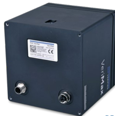
REA VeriMax ports