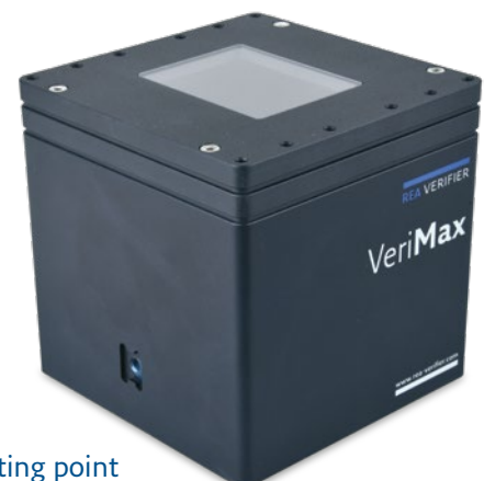
REA VeriMax lateral mounting point