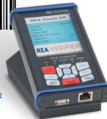
REA Check ER