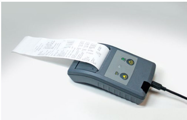
Portable report printer